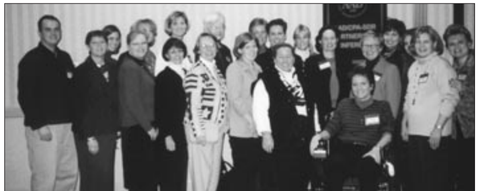
Coalition members gather at the AAD/CPA-SDR partnership conference.