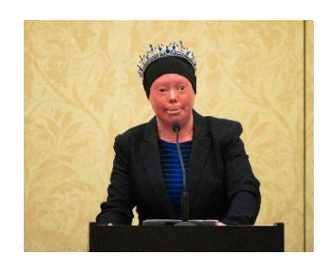
Workshops and Breakout Sessions— 48 different sessions held at the National Conference in Providence.