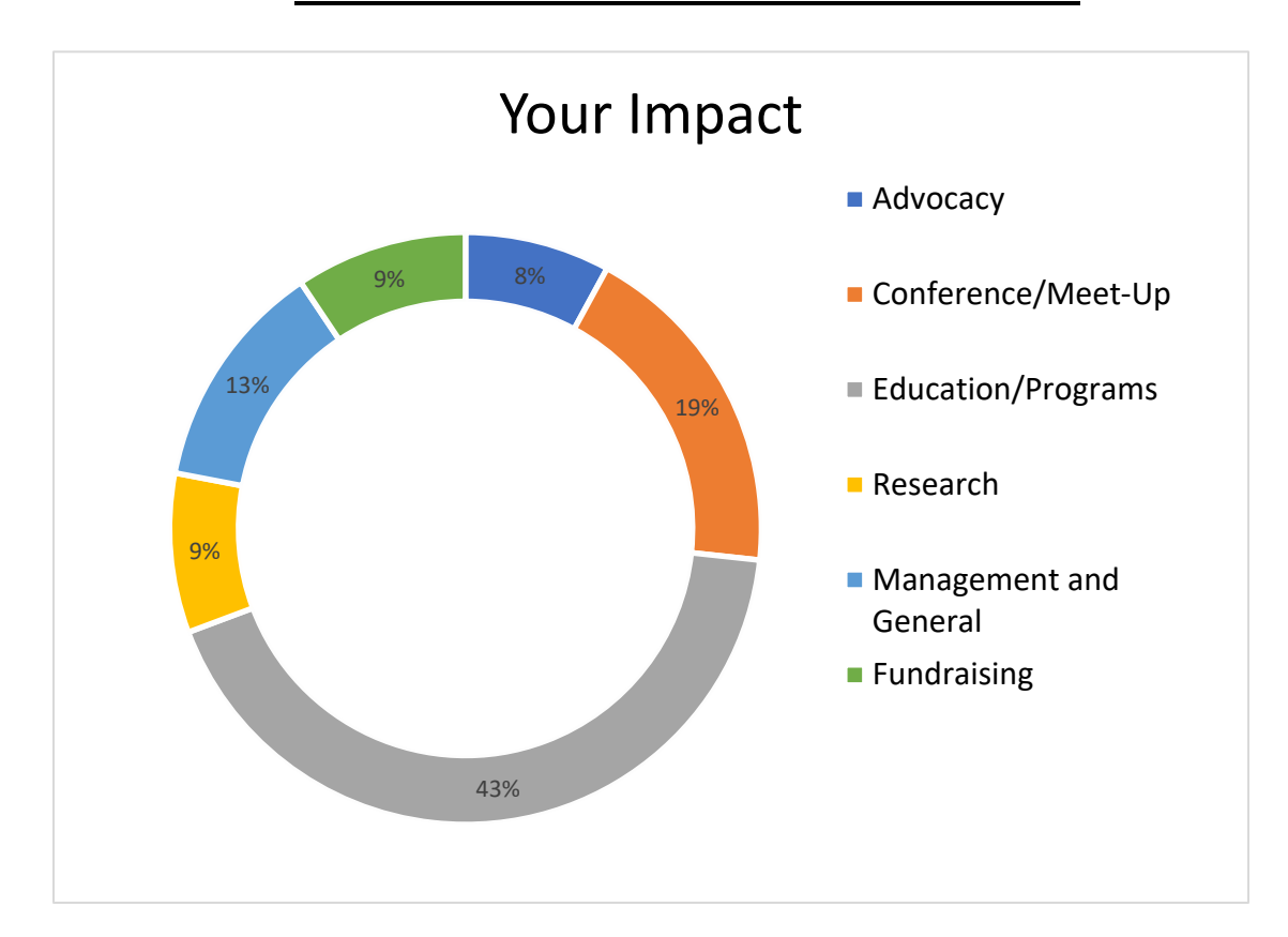
Total Mission Program and Support Services$891,681